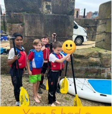
Year 5 had a fabulous day Paddle Boarding and Canoeina!