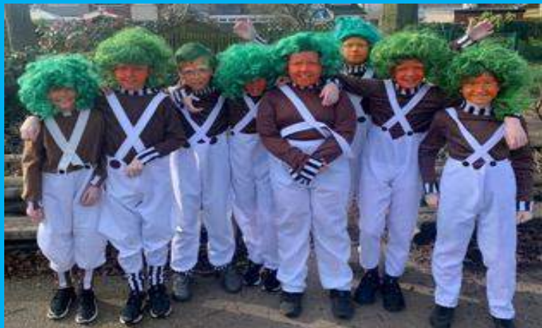
The Oompa- Loompas